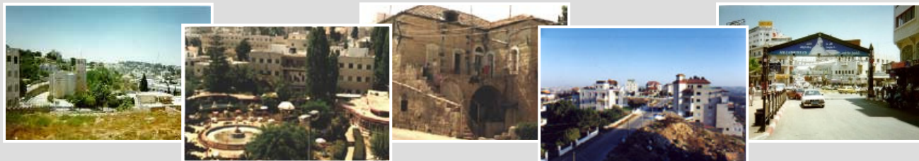
Like much of Palestine, the city of Ramallah is building its infrastructure back up after years of turmoil and uncertainty. This historic region is in dire need of experts in many fields to help it achieve a lasting peace and prosperity.

This is by no means easy work, but it is rewarding—and, because Project Hope is a 501(c)(3) tax-exempt charity, gifts of billable time and services rendered may be deducted in the same manner as a gift of money/goods). Contact the AFRP for more information.